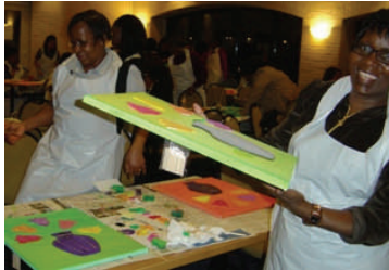
Women enjoying the creative art evening