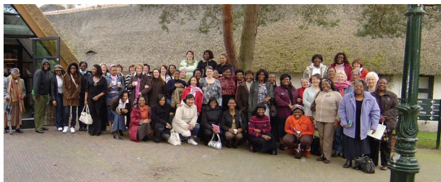
Part of the group who attended—braving the drizzle!